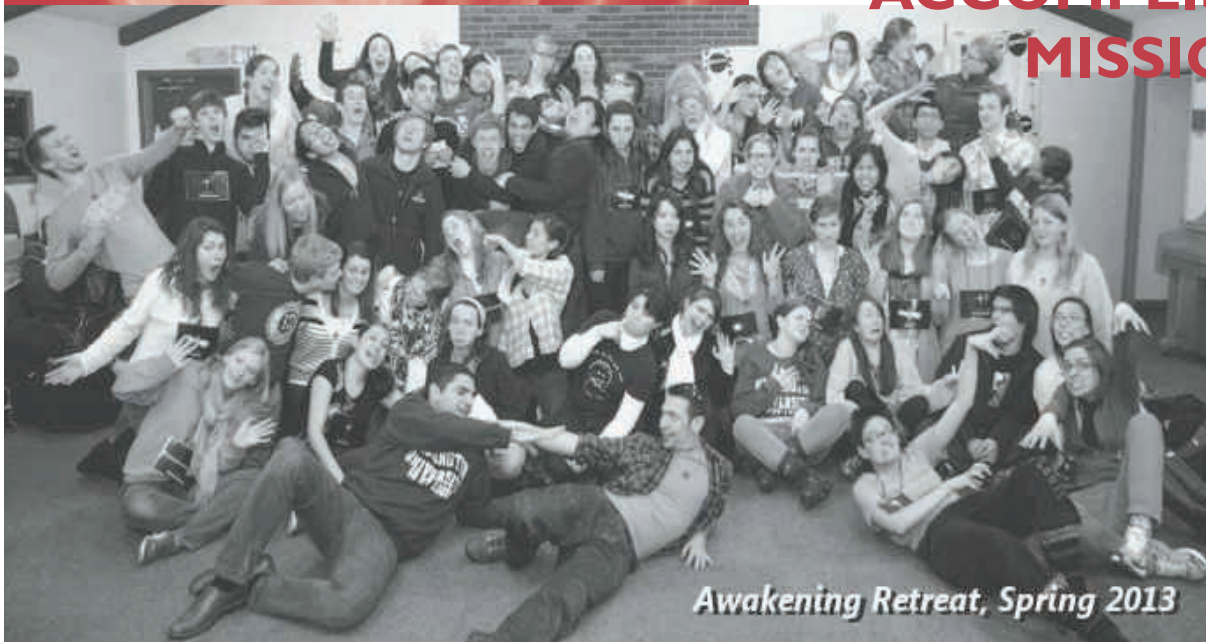
Awakening Retreat, Spring 2013